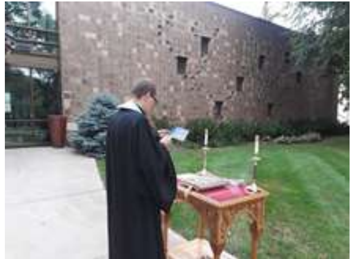
Paraklesis service in August