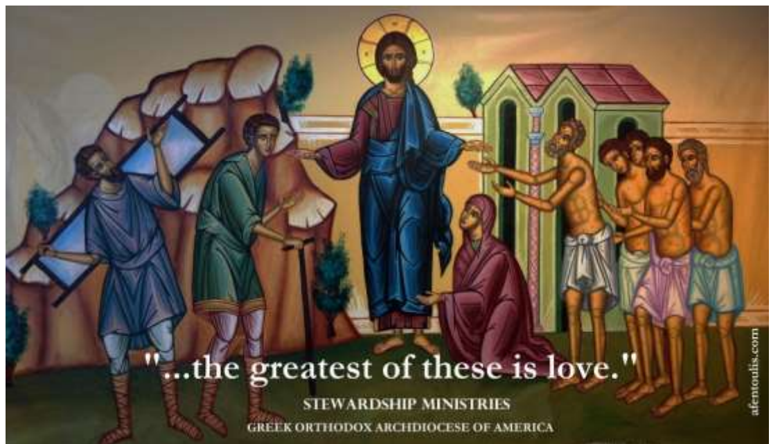
2021 Orthodox Christian Stewardship Program