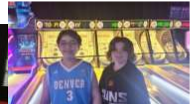
Dave & Busters May 13, 2022