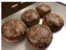
Artoklasia baking, May 22