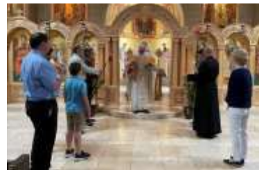
Sensory Saturday, June 4