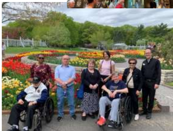
Arboretum trip, May 19