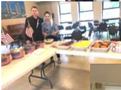
Memorial Day fellowship hour, May 29