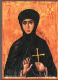
Saint Theodosia May 29

Please donate a Festal Icon (11" x 14") in memory of a loved one. The cost is $75.00 per icon. The icons are displayed in the church nave and are put out for veneration on the Feast Day of the Saint or event they represent. See list below for icons still needed.