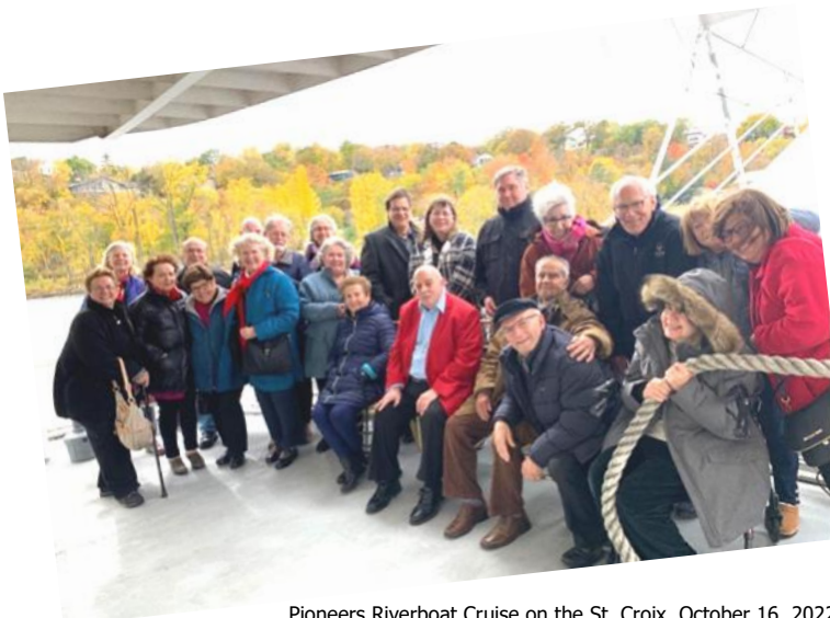
Pioneers Riverboat Cruise on the St. Croix, October 16, 2022.

St. Philoumenos of Jacob's Well-November 16 St. Merkourios the Great Martyr-November 25 St. Nikon the Preacher of Repentance-November 26 St. Alypios the Stylite-November 26 St. Zacchaeus the Tax Collector-15th Sun. Luke Three Patriarchs (Abraham, Isaac, Jacob)-Sun before Nativity Great Martyrs after Fall of Constantinople Holy Fathers of Nicaea (1st Ecumenical Synod)-7th Sun Pascha 1st Ecumenical Synod-Sunday after July 13th 4th Ecumenical Synod Martyred Fathers of Mt. Athos (by Latins) Holy Unmercenaries Three Pillars of Orthodoxy Seven Ecumenical Councils